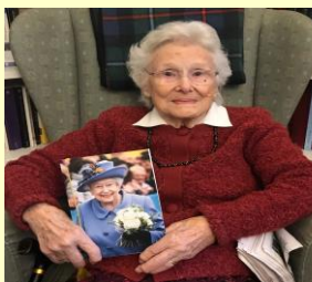
100 YEARS YOUNG!!!

DON'T FORGET OUR VALENTINE'S TEA PARTY 14 th FEBRUARY 2:30-4:30 We do hope you can come!